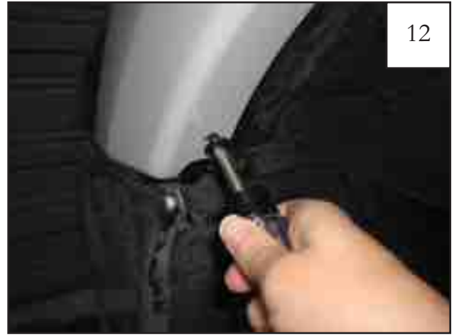
Start a supplied Truss Head Screw through forward-most hole in flare and into "U" Clip installed in Step 8. Note: For the Limited version, install this screw directly into hole in fender. Ensure flare is properly positioned and tighten all screws.