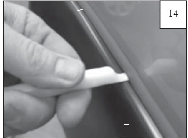
Using flat end of supplied Edge Trim Tool (ET1-0002), seat edge trim against flare by inserting straight end between edge trim and flare at one end. Next, slide around entire edge to the other end.