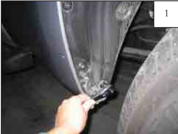
Using a socket wrench with a 10mm socket, remove lower screw from front of rear wheel well as shown.