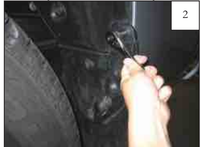
Remove top screw from mud flap as shown.