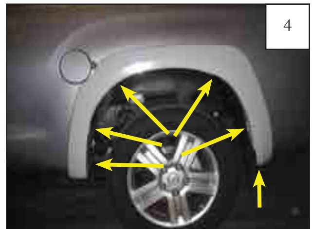
Hold the flare firmly on the fender. Start a supplied Hex Screw through each hole in flare and into hole in fender (six places).