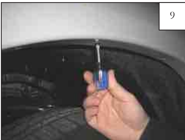
Align holes in flare with holes in clips. Start three supplied Serrated-Flange Screws through three holes in flare and into "S" Clips installed in Step 7. Note: It is helpful to use an awl to located holes in clips.