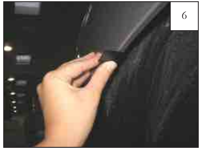
Remove flare from fender. Center a supplied Black Tab over each mark made in Step 4.