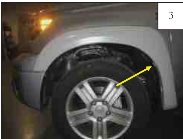
Hex Screw location.