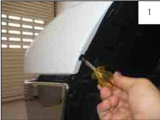
Using a Phillips screwdriver, remove plastic fastener from front of wheel well. Note: For the Limited version, a flat head screw driver will be needed.