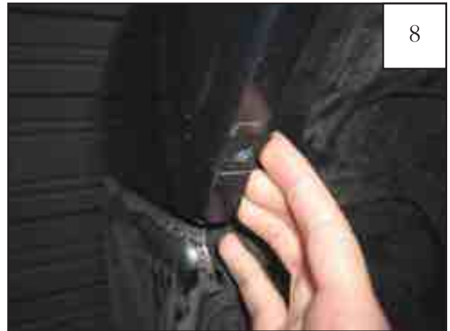
Slide a supplied "U" Clip over the fender lip, aligning with forward-most hole in fender. Note: For the Limited version, skip this step.