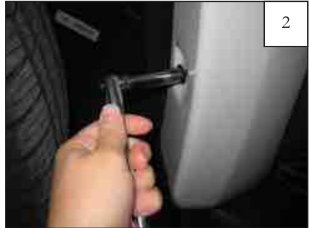
Start a supplied Hex Screw through top rear hole in flare and into factory hole in rear of wheel well.