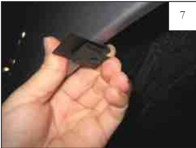
Slide a supplied "S" Clip over each Tab.