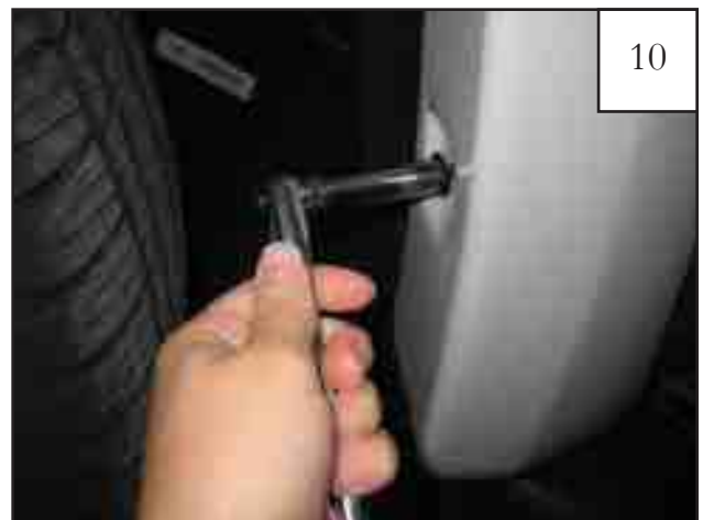
Make sure flare is positioned correctly on vehicle. Tighten all screws.