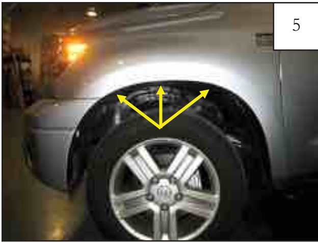
"S" Clip locations.