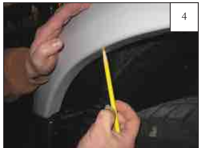
Hold the front of the flare firmly on the fender. Starting with the second hole from the front of the flare, mark three clip locations with a grease pencil.