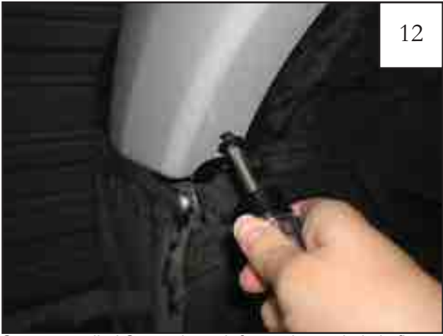
Hex Screw locations.