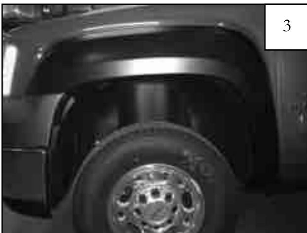
Verify fit and tighten all screws.