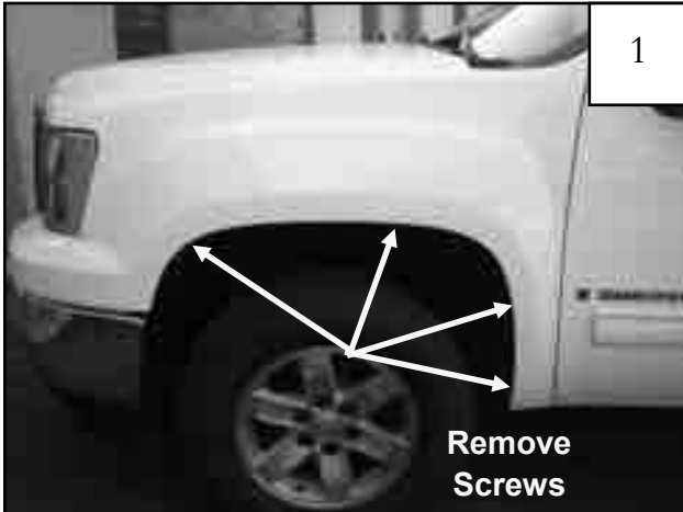
Using a 7mm socket, remove four factory screws. Retain screws for later use.