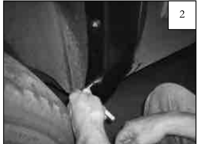
Position flare on fender, and reinstall four factory screws removed in Step 1. If needed, use an awl to locate holes.