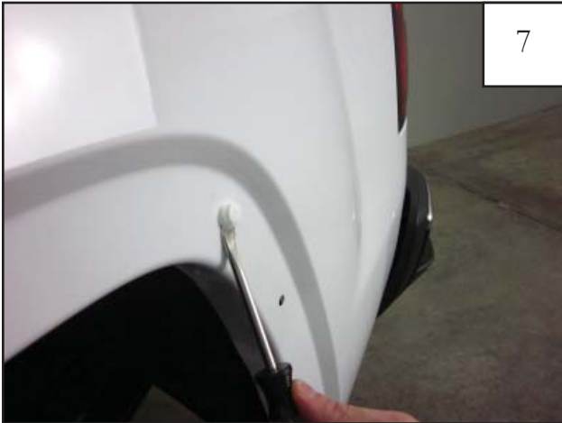
Use a pry tool to remove any remaining factory fasteners that may have stayed on the vehicle during the removal process.