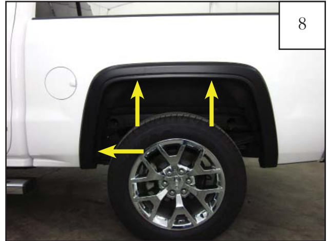
Hold rear flare up to wheel well to confirm fit. While holding flare on vehicle, install supplied screws (SW1-0056) into the 2 upper and 1 lower factory hole locations. Do not fully tighten at this time.