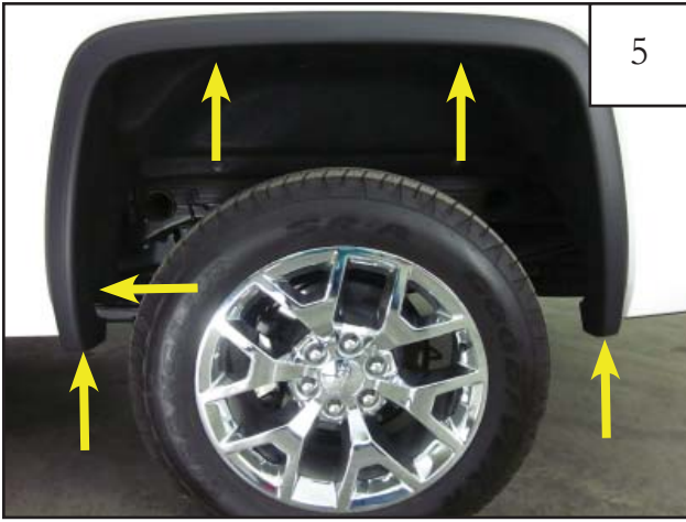
Remove fasteners from factory wheel arch molding using a T-15 Torx Bit for upper and lower wheel well fasteners and a 10mm deep socket and wrench for the lower 2 locations. Save the two lower fasteners for re-installation.