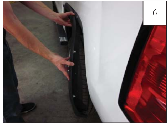
Starting at the lower rear end of the factory flare, firmly grip part and pull to remove from vehicle. Note: You will hear popping sounds as the factory fasteners release from vehicle. This is normal.