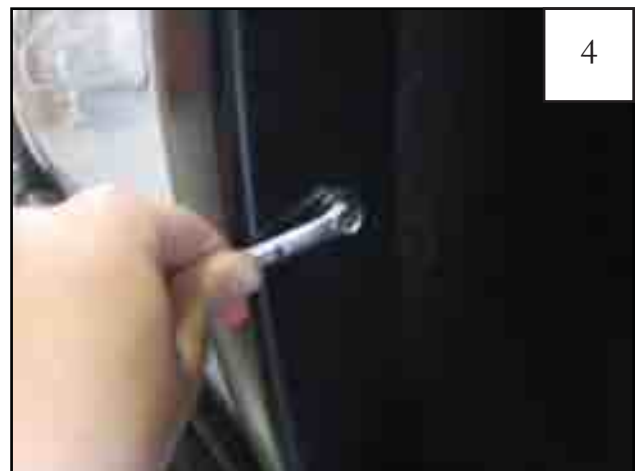
Reinstall factory screws removed in Step 1.