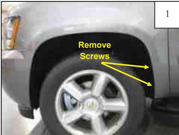
Using a 9/32" socket, remove two factory screws. Retain screws for later use.