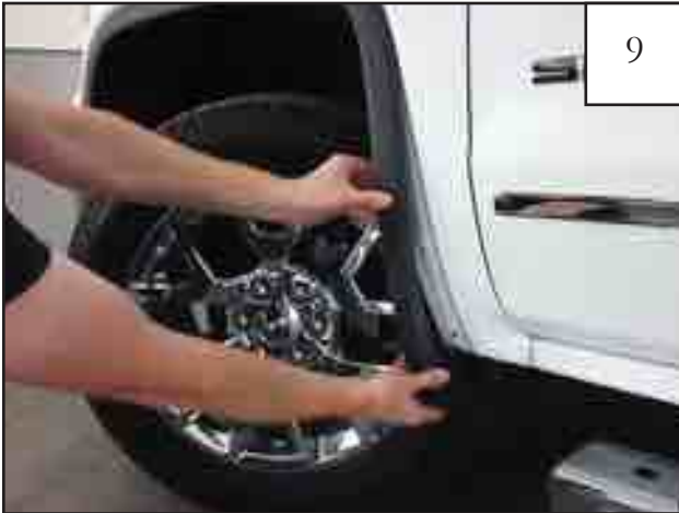
Starting at the lower rear end of the factory wheel arch molding, firmly grip part and pull to remove from vehicle. Note: You will hear popping sounds as the factory fasteners release from vehicle. This is normal.