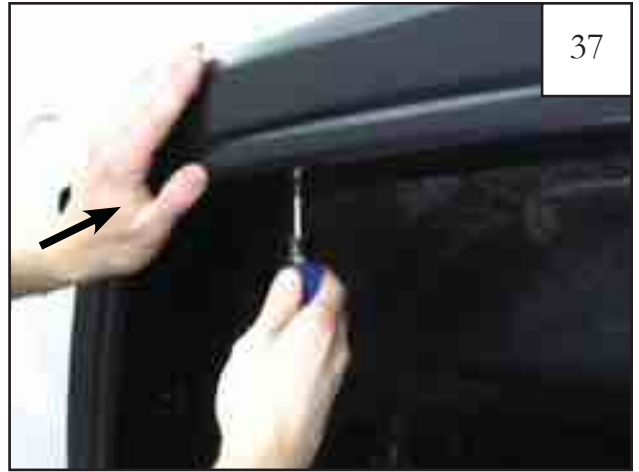
Press flare towards vehicle and fully tighten all remaining fasteners.