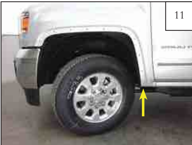
Reinstall factory fastener removed in step 6 using a 1/2" socket and wrench.