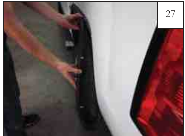
Starting at the lower rear end of the factory flare, firmly grip part and pull to remove from vehicle. Note: You will hear popping sounds as the factory fasteners release from vehicle. This is normal.