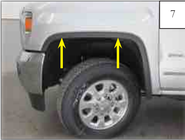
Remove two fasteners along top of factory wheel arch molding using a T-15 Torx bit.