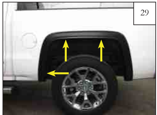
Hold rear flare up to wheel well to confirm fit. While holding flare on vehicle, install supplied screws (SW1-0056) into the 2 upper and 1 lower factory hole locations. Do not fully tighten at this time.