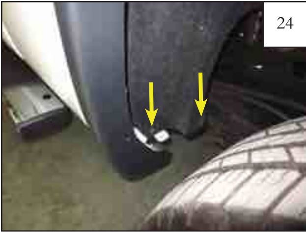
Re-install two factory screws into wheel well liner.