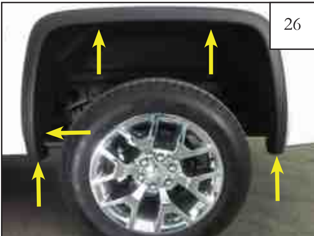
Remove fasteners from factory wheel arch molding using a T-15 Torx Bit for upper and lower wheel well fasteners and a 10mm deep socket and wrench for the lower 2 locations. Save the two lower fasteners for re-installation.