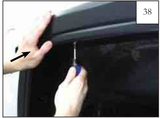
Press flare towards vehicle and fully tighten all remaining fasteners.