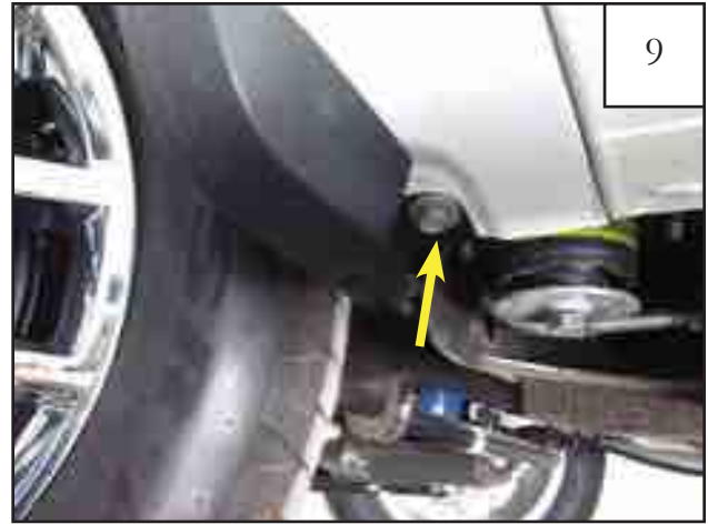
Remove fastener from rear underside of factory wheel arch molding using a 1/2" socket and wrench. Save for reinstallation.