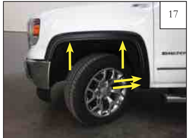
17 While holding Flare on vehicle, install supplied screws (SW1-0056) into the two upper and lower factory holes locations. Do not fully tighten at this time.