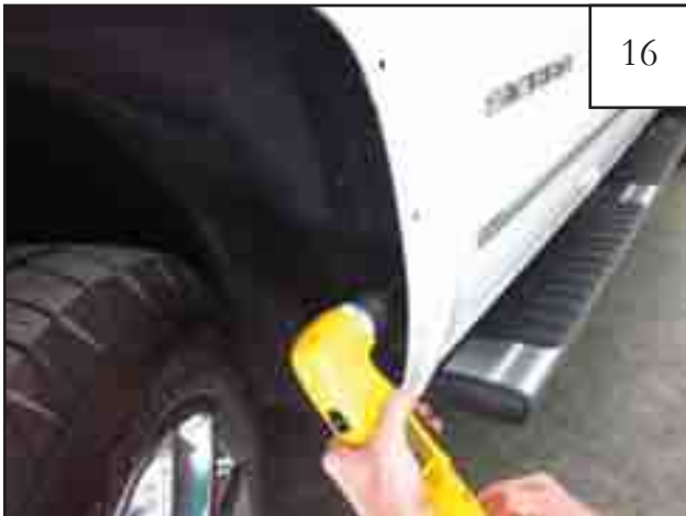
16 Remove the flare. Using a 3/32" drill bit, drill a pilot hole through the factory wheel well liner and sheet metal at location marked in previous step.