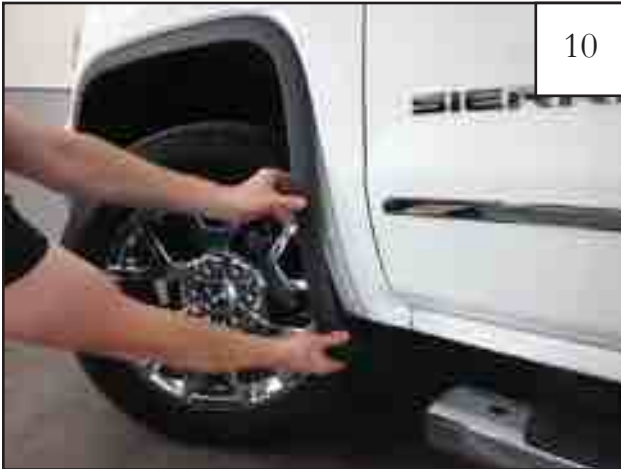
Starting at the lower rear end of the factory flare, firmly grip part and pull to remove from vehicle. Note: You will hear popping sounds as the factory fasteners release from vehicle. This is normal.