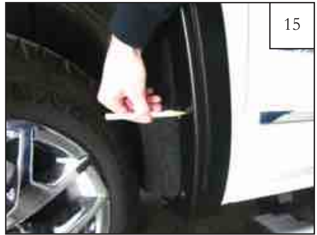
15 Using a grease pencil or marker, mark one hole location for drilling using the upper rear hole location in the flare as a guide. Note: This step not needed for models with factory installed mudflaps.