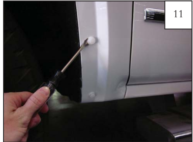
Use a pry tool to remove any remaining factory fasteners that may have stayed on the vehicle during the removal process.