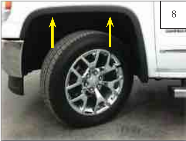
Remove two fasteners along top of factory wheel arch molding using a T-15 Torx bit.