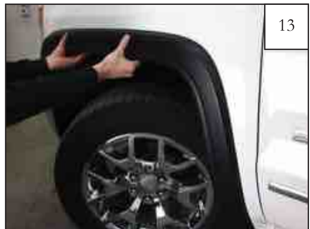
Hold Front Flare up to wheel well to confirm fit. Do not install fasteners at this time.