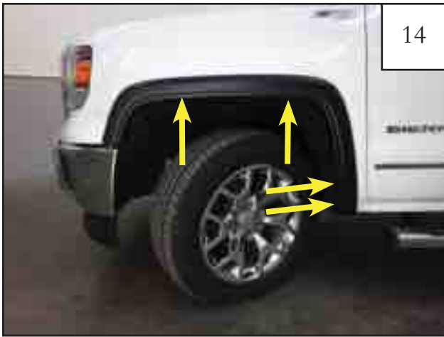
14 While holding Flare on vehicle, install supplied screw (SW1-0056) into the four factory hole locations as shown. Do not fully tighten at this time.