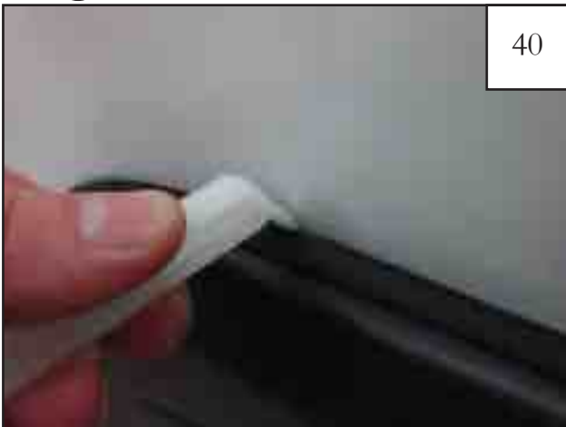
Using supplied Edge Trim Tool (ET1-0002), seat edge trim against vehicle by hooking curved end under edge trim at one end of flare. Next, slide around outer edge of flare to the other end.