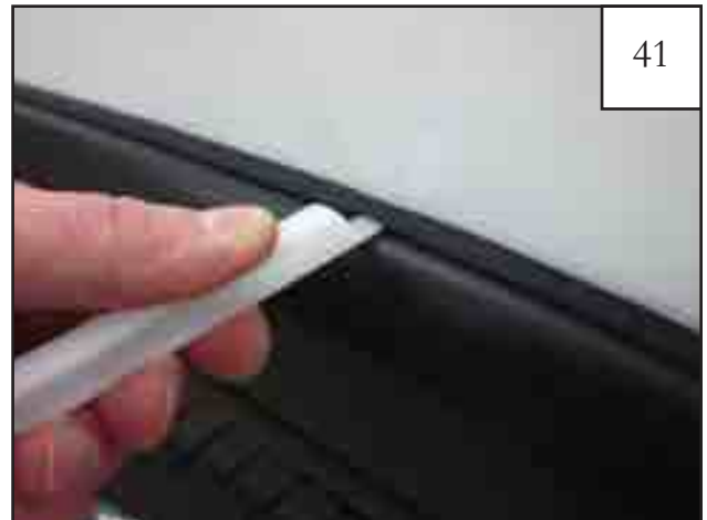
Using flat end of supplied Edge Trim Tool (ET1-0002), seat edge trim against flare by inserting straight end between edge trim and flare at one end. Next, slide around entire edge to the other end.