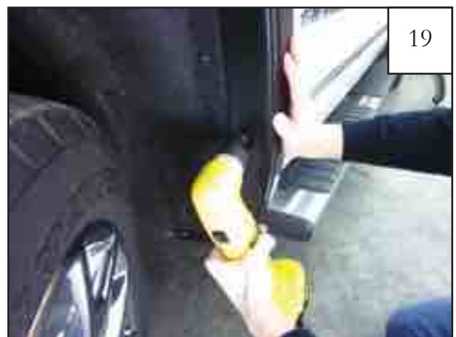
19 Install self-tapping screw (SW1-0066) into pilot hole drilled in step 16. Press flare towards vehicle while fully tightening. Note: This step not needed for models with factory installed mudflaps.