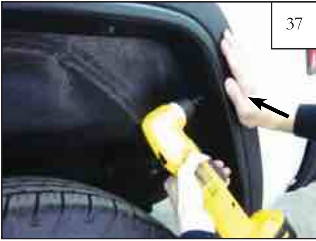
Install self-tapping screws (SW1-0066) into pilot holes drilled in step 36 (3 places). Press flare firmly towards the vehicle while fully tightening.