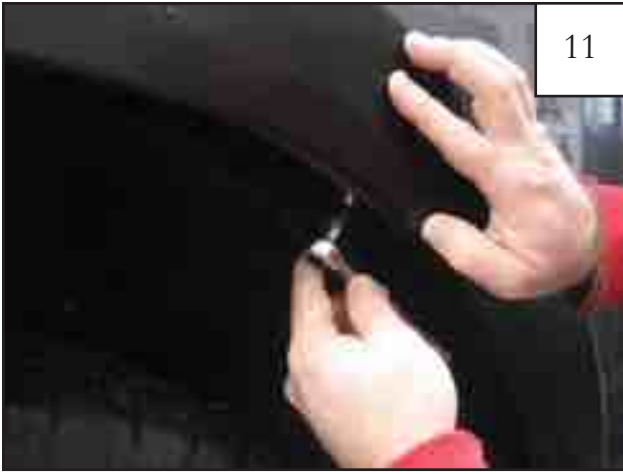
Hold flare in place while you start factory screws using an 8 mm socket wrench. Do not tighten.