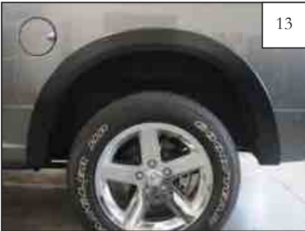
Completed rear flare installation.