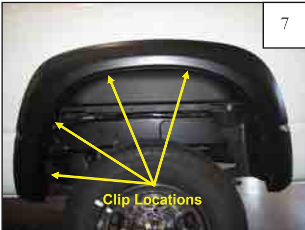
Slide a supplied clip over fender lip, aligning with existing holes in fender flare (4 places).