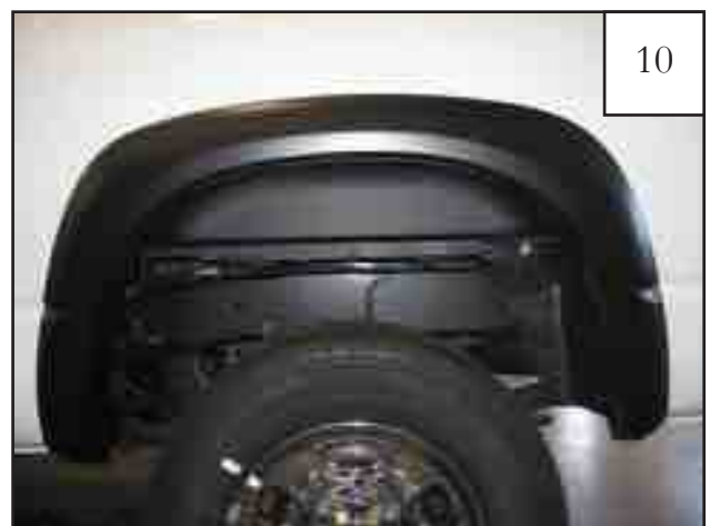
Make sure flare is positioned correctly on vehicle. Tighten all screws.