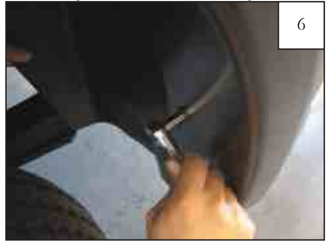
Holding flare in position on fender, reinstall screws removed in Step 5. Do not tighten. (An awl may be used to align the threaded clip with holes in flare and fender lip) Note: Make sure screws engage in splash shield.