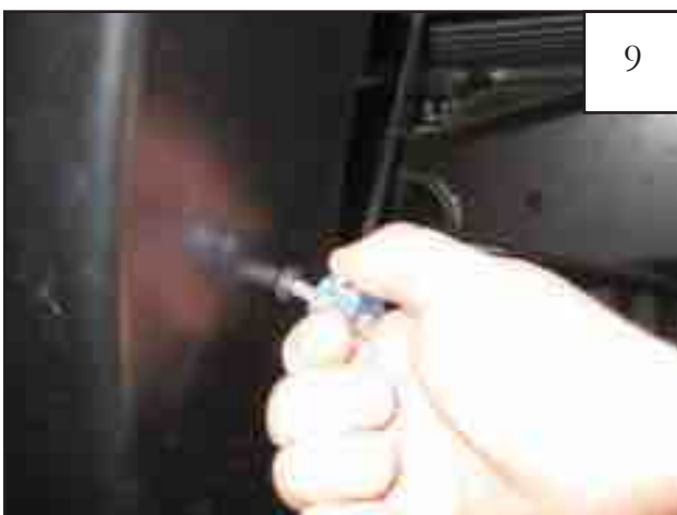
Using #2 Phillips Screwdriver, insert a supplied Truss-Head Screw through existing holes in flare and into holes in clips (4 places).