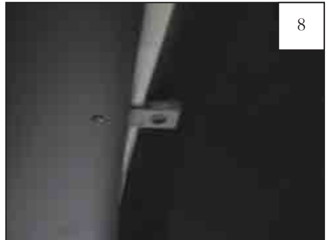
The top two Clips will be offset of fender to allow for screw to tighten (there are no factory holes in fender at these locations).