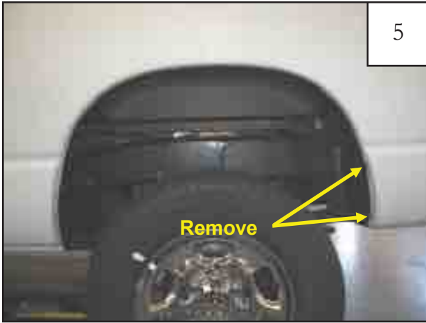
Using an 8mm socket, remove two factory screws from rear of wheel well. Retain for future use.