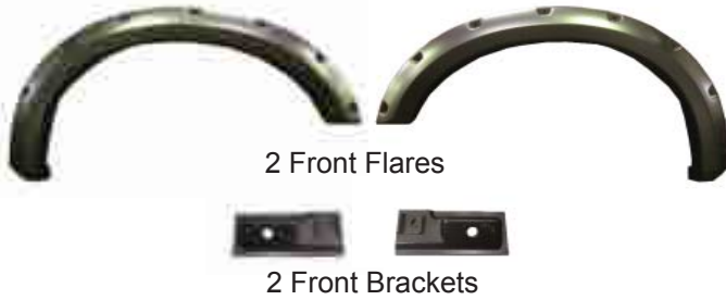
2 Front Flares