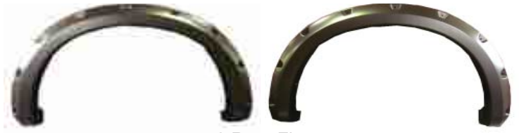
2 Rear Flares