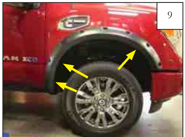
Position flare on fender. Line up holes in flare with the factory holes and start the two 3 supplied screws (SW1-0049) where indicated in picture. Do not fully tighten screws.