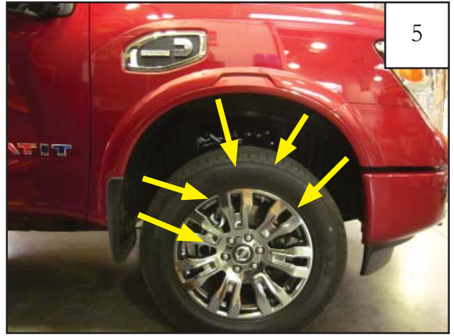
Using a #2 Phillips Screwdriver, remove factory flares if installed.