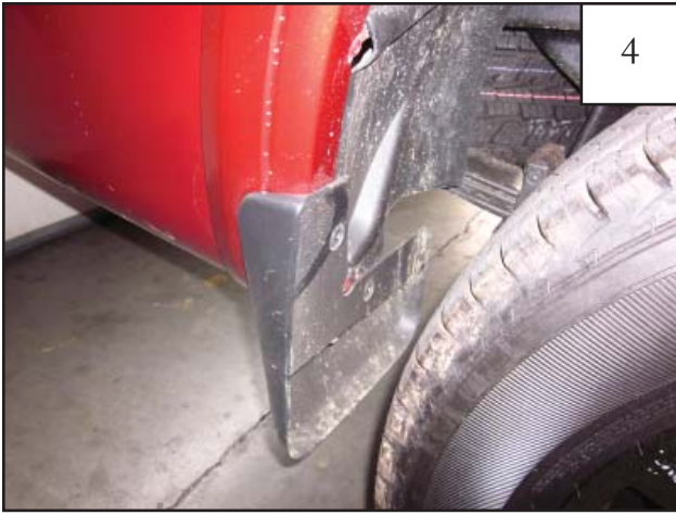
Using a #2 Phillips Screwdriver, remove factory mud flaps if installed,