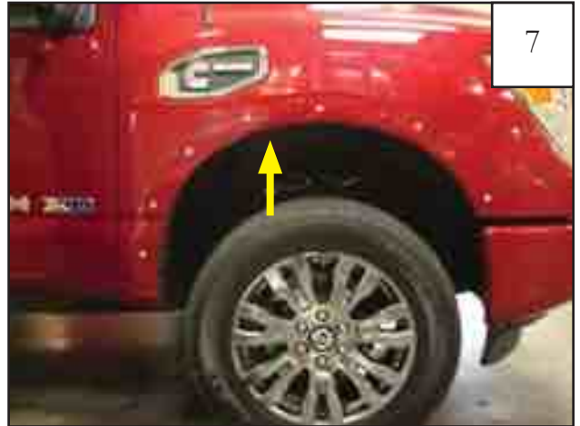
Using a #2 Phillips Screwdriver, remove factory screw from wheel well.