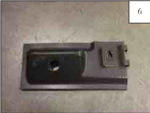
Install supplied clip (CL1-0022) on end of inner bracket.