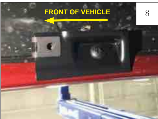
Use factory screw to install inner bracket in wheel well where shown.