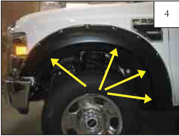
Remove four factory screws with a 7/32" socket wrench. Save screws for reinstallation.