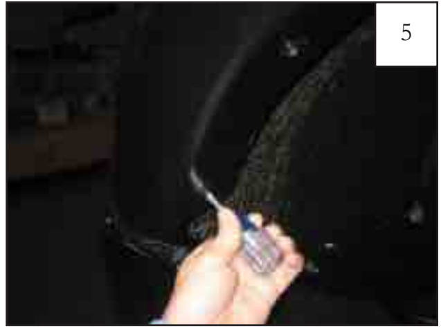
Using a #2 Phillips Screwdriver, install two supplied Tufloks (RV1-P001) through additional holes in flare and into fender. NOTE: Use a push-twist motion.