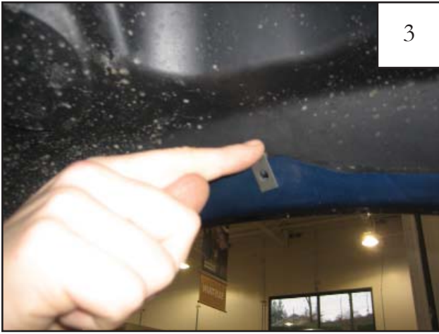
Place supplied clip (CL1-0011) over existing factory hole.