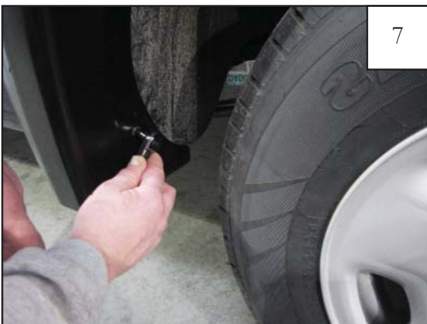
Position and hold flare on fender and reinstall rear most factory screw using a 7/32" socket wrench.