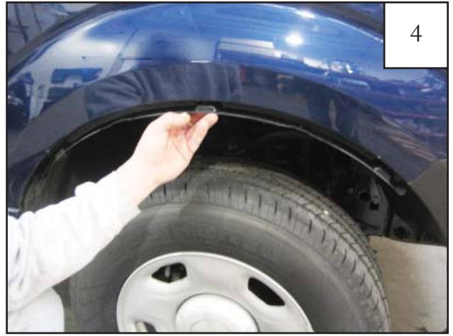
Line up the holes in the inner piece with the two uppermost factory holes and the speed clip. NOTE: Driver's side inner piece is marked with an "L" and passenger's side inner piece is marked with an "R".