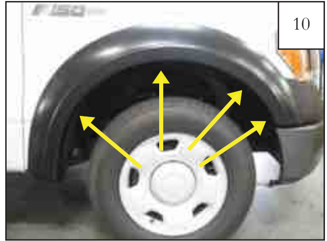
Black plastic retainer locations.