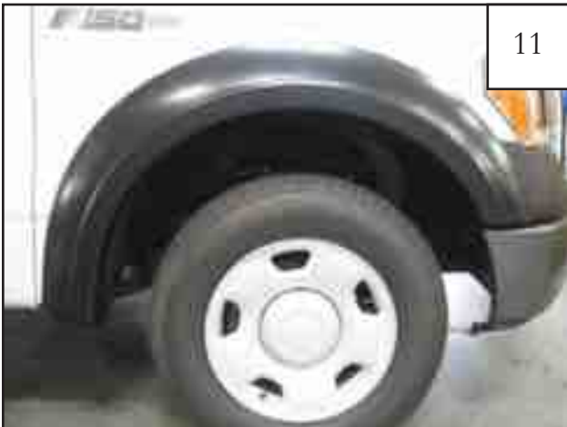
Completed front flare installation.