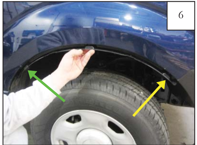
Using a 7/32" socket wrench, reinstall the factory screws through the inner piece.