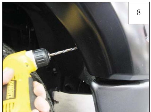
Still holding flare in position on fender, drill through bumper cover with a 1/4" drill bit using the forward most hole in the flare as a guide.