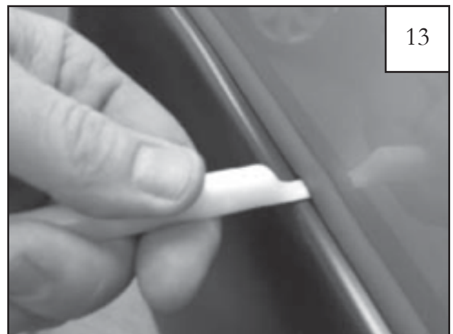
Using flat end of supplied Edge Trim Tool, seat edge trim against flare by inserting straight end between edge trim and flare at one end. Next, slide around entire edge to the other end.