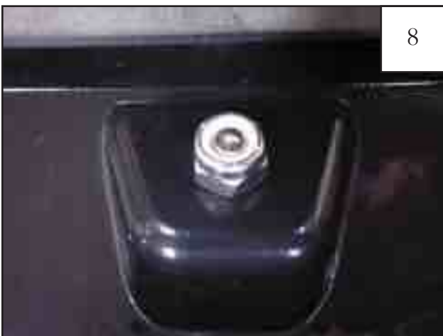
Place a Nut (NU1-0019) over the end of each Bolt and tighten, using a 1/2" wrench for the Nut and the supplied Torx Bit (SW1-0052) for the Bolt. Repeat for remaining pockets.