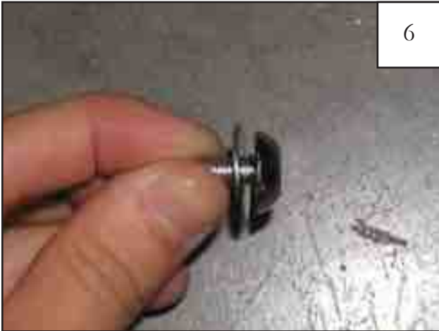
Put a Washer (WA1-0012) on each Bolt (SW1-0067).