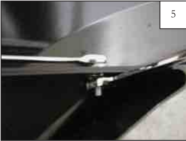
Install a supplied Nut (NU1-0011) on ends of screws and tighten