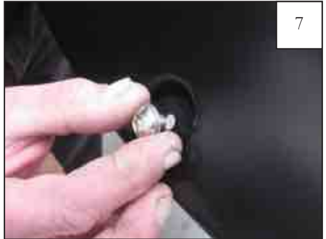
Put each Bolt/Washer combination through a pocket hole in the flare, Bolt head and Washer on the outside.