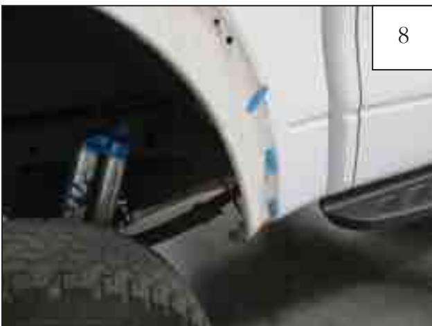
Using pliers, remove factory plastic clips. Clean the fender area.