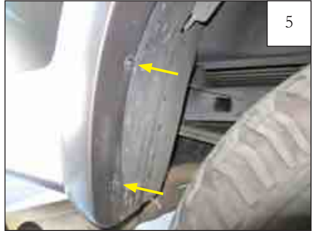
Use a 7/32 socket to remove the 2 factory screws located at the rear of the wheel well. Retain screws for re-installation later.