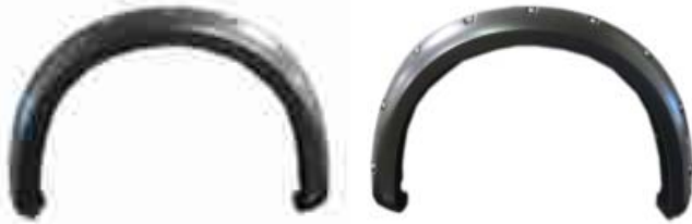
Rear Flare x 2