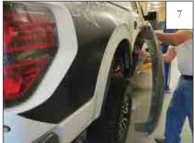
Carefully pull factory flare away from fender and remove. Using pliers, remove factory plastic clips. Clean the fender area.