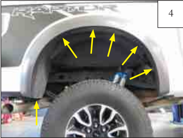
Using a pry tool, remove 5 retainers from the factory flare. Discard factory retainers.