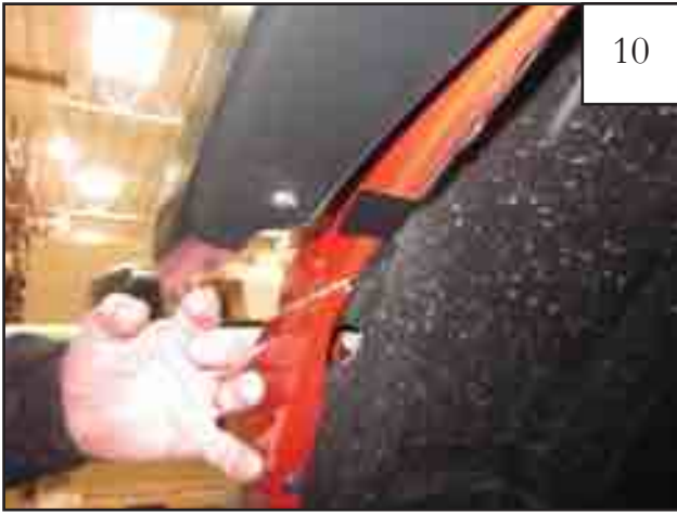
Pull flare outward to access the fender lip (with Screw [SW1-0036] still installed). Center a Tab (MT1-0002) over each mark made in Step 8.