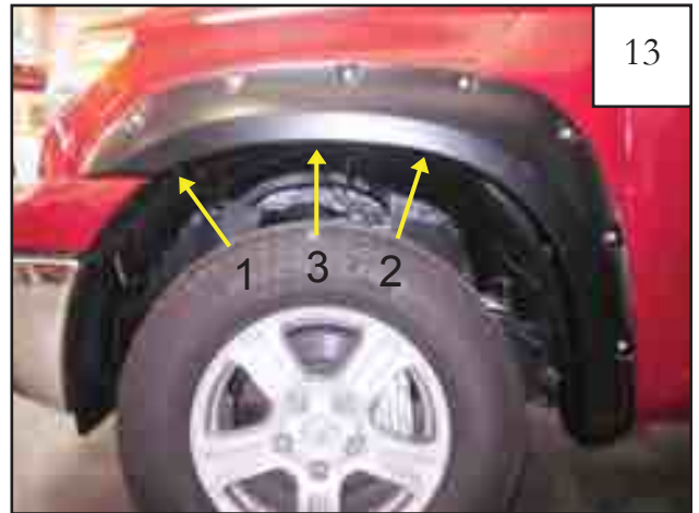
Start Screw (SW1-0050) in location #1 first, then move to #2, and start in location #3 last.