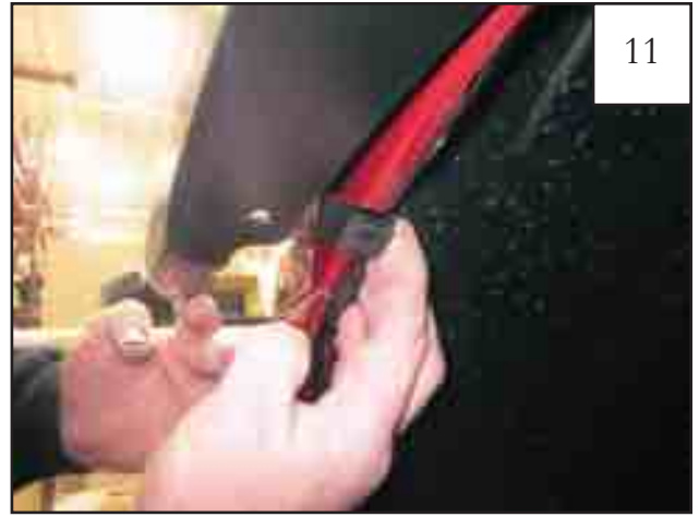
Slide a Clip (CL1-0005) over each Tab (MT1-0002).