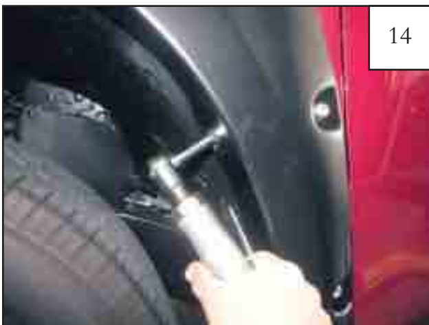
Start Screw (SW1-0036) through the three lower rear holes in flare and into factory holes in rear of wheel well.