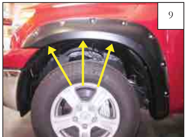
Hold front of the flare firmly on the fender. Mark three Clip (CL1-0005) locations using the holes in the flare as a guide.