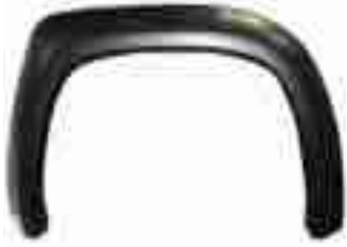
Driver Side x1