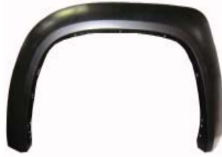
Passenger Side x1