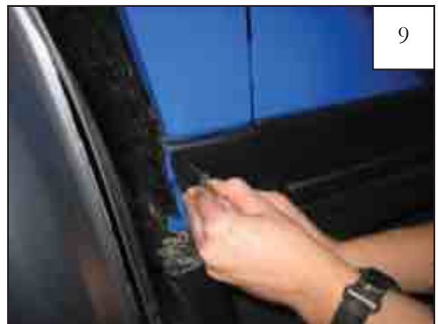
Trim an additional 3/4" from rocker, so that end of rocker is within confines of sheet metal. NOTE: The Flare will cover this area to 1/4" from the door seam.