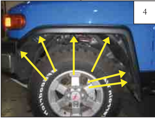
Remove six bolts from wheel well using a 10mm socket.