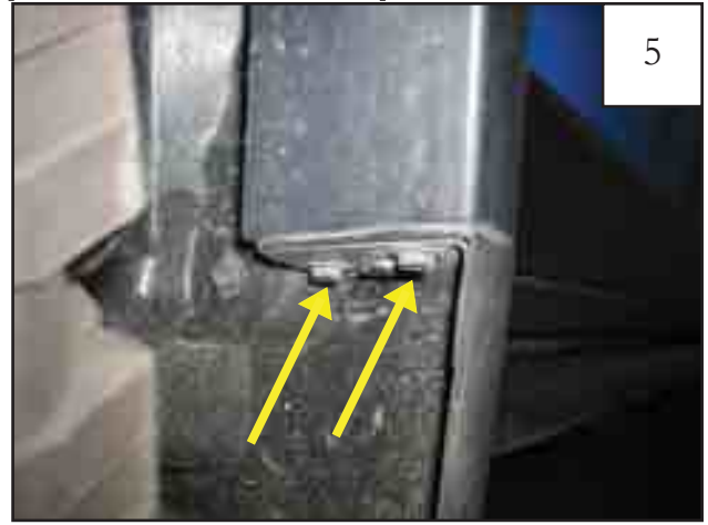
Remove two bolts connecting factory flare to rocker as shown (one plastic fastener removed in Step 4 is located here as well).