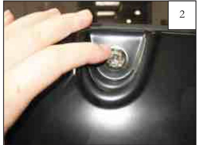
Put each Bolt/Washer combination through a pocket hole in the flare, Bolt head and Washer on the outside.