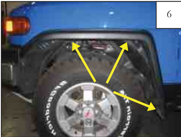
Remove three plastic fasteners using a flat head screw driver or pry tool.