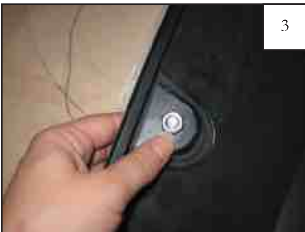
Place a Nut (NU1-0019) over the end of each Bolt and tighten, using a 1/2" wrench for the Nut and the supplied Torx Bit (SW1-0052) for the Bolt. Repeat for remaining pockets.