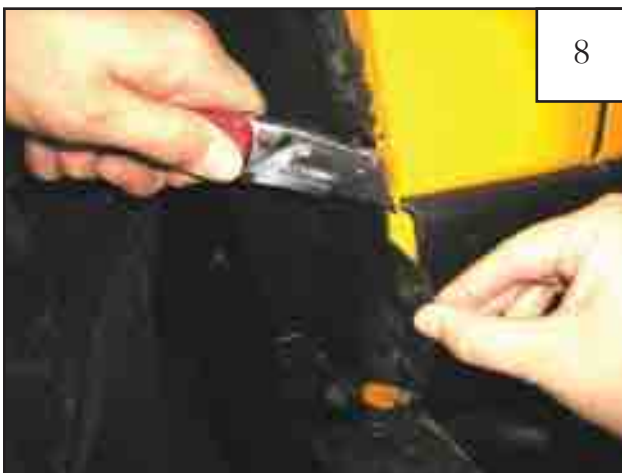
Using a utility knife, cut splash guard flush with edge of sheet metal also.