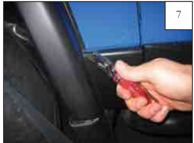
Using a utility knife, cut along seam connecting factory flare to rocker. Cut down to mud flap area.