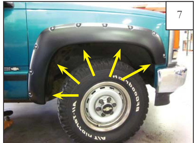
Hole locations to be marked.