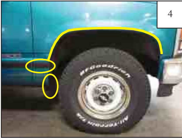
Remove factory fender trim, front fender body side molding and mud flaps (when installed).