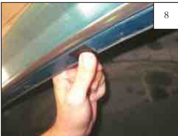
Remove flare. Center a supplied Tab (MT1-0002) over the marks made in Step 6, aligning edge of tab with inside edge of fender lip (tab may extend over outside of fender).