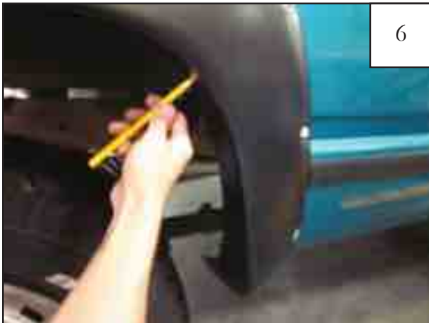
Hold flare in position on fender using moderate pressure. Using a grease pencil, mark five hole locations using the holes in the flare as a guide. (See Step 7)