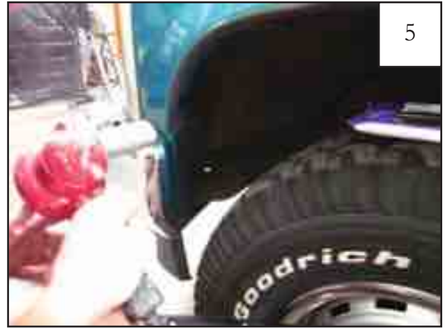
Use hair dryer or heat gun to heat molding. This helps loosen the adhesive making it easier to remove.