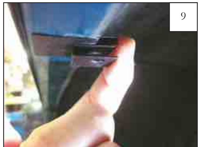
Install supplied clips (CL1-0005) over each tab location.