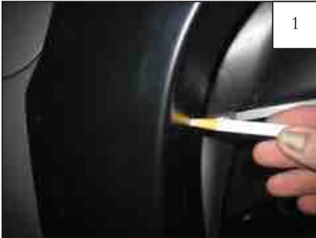
Holding flare in position on fender, use a grease pencil to mark six hole locations.