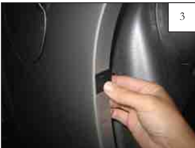
Center a supplied black plastic tab over each mark made in Step 1, aligning edge of tab with inside of fender lip (tab may extend over outside of fender).