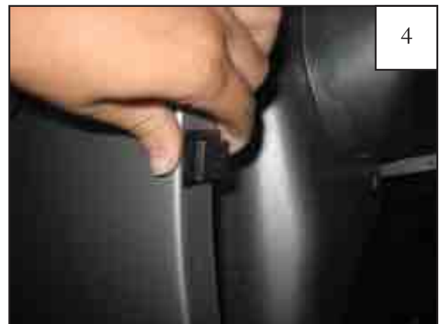
Slide a supplied clip over each black tab. Clips may need to be adjusted to align with holes in flare.