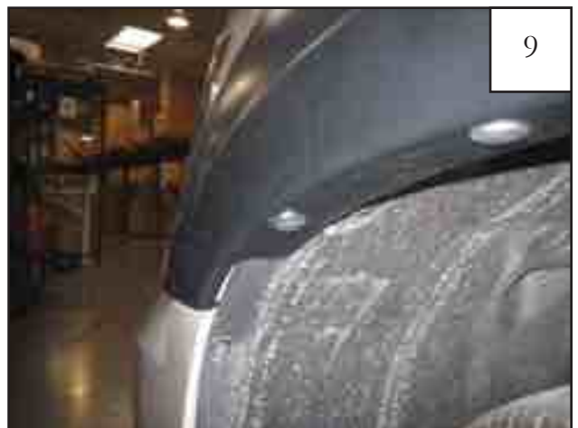
Using hole located in forward portion of flare as a guide, drill through the splash shield with a 5/16" bit. Holes in flare and splash shield should align with factory hole located in fender.