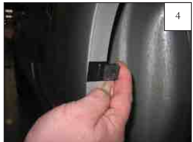
Slide a supplied clip over each black tab. Clips may need to be adjusted to align with holes in flare.