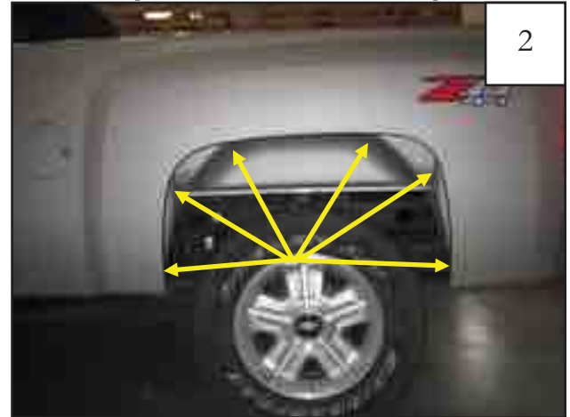
Six hole locations.