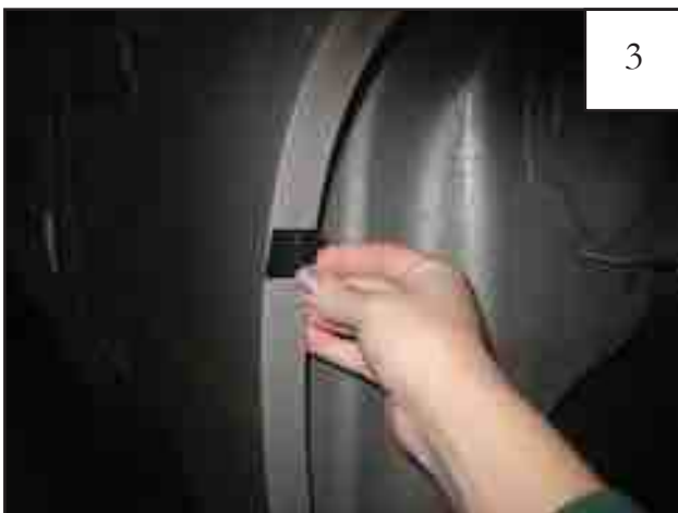
Center a supplied black plastic tab over each mark made in Step 3, aligning edge of tab with inside of fender lip (tab may extend over outside of fender).