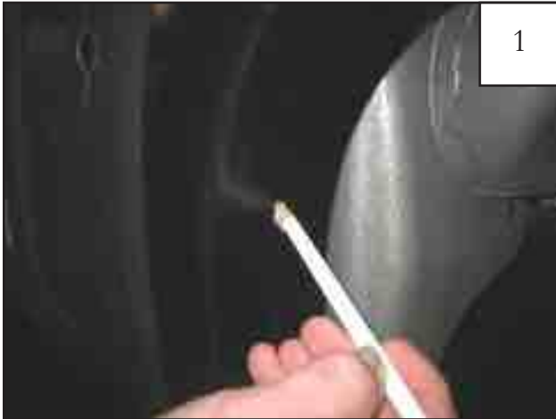
Holding flare in position on fender, use a grease pencil to mark six hole locations.