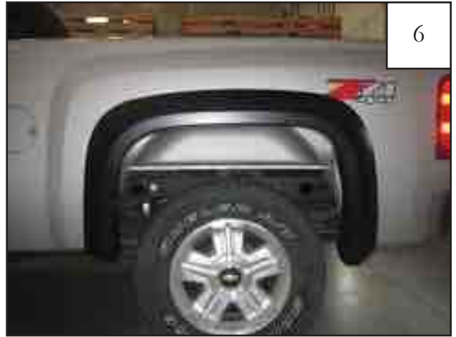
Verify fit and tighten all screws.