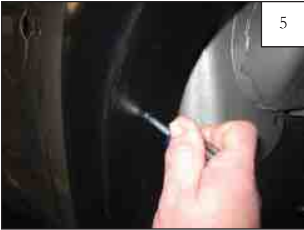
Reposition flare on fender. Start a supplied serrated-flange screw through the hole in the flare, and into each clip.