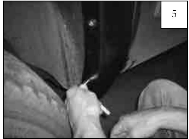
Position flare on fender and reinstall the four factory screws removed in Step 4.