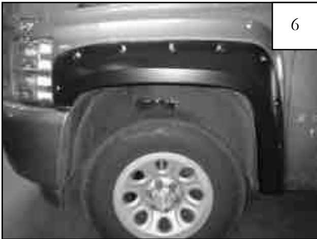
Verify fit and tighten all screws.