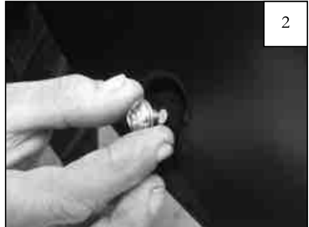
Put each Bolt/Washer combination through a pocket hole in the flare, Bolt head and Washer on the outside.