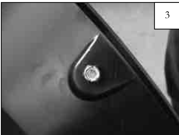
Place a Nut (NU1-0019) over the end of each Bolt and tighten, using a 1/2" wrench for the Nut and the supplied Torx Bit (SW1-0052) for the Bolt. Repeat for remaining pockets.