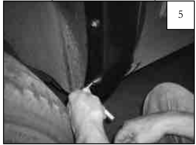
Position flare on fender and reinstall six factory screws removed in Step 4. If needed, use an awl to locate holes.