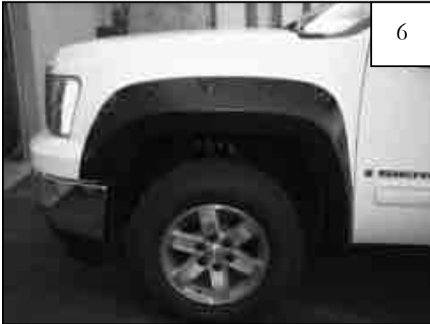
Completed front flare installation.