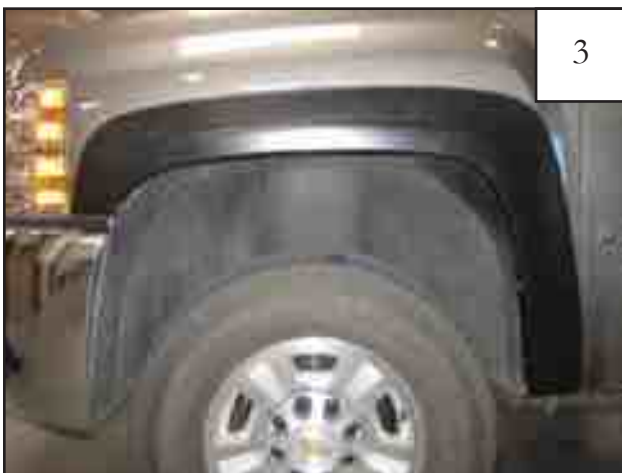
Completed front flare installation.