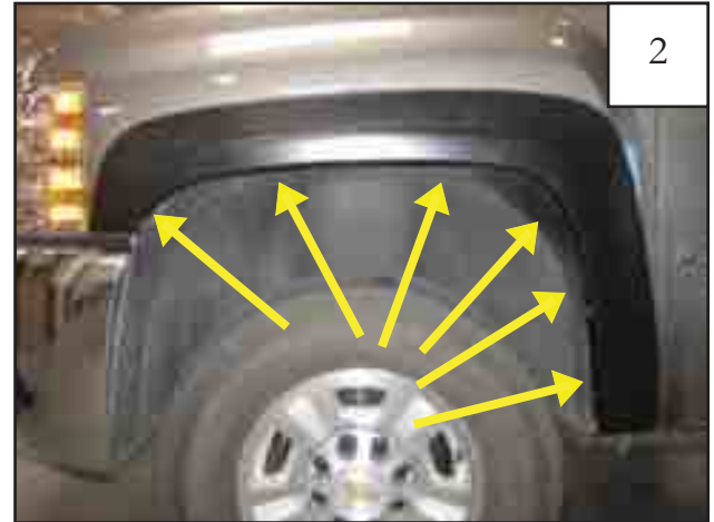
Install six tuflocks using a #2 stubby screwdriver.