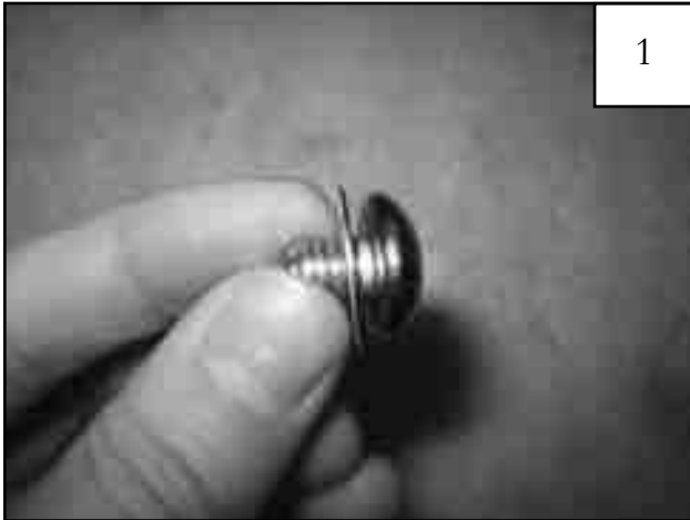
Put a Washer (WA1-0012) on each Bolt (SW1-0059).