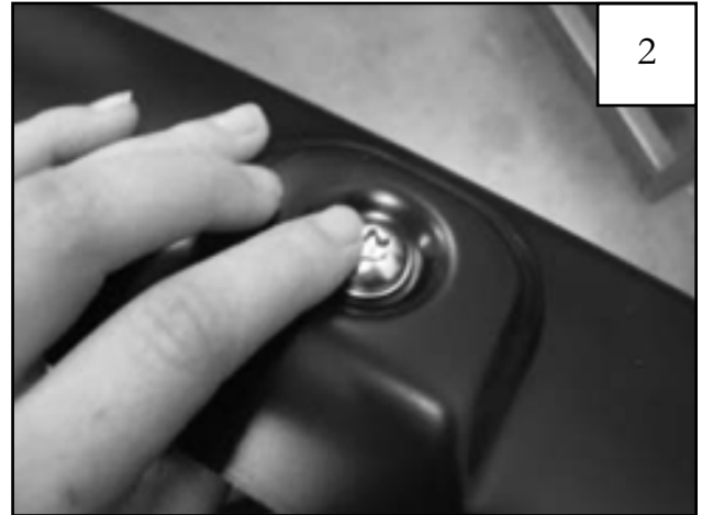
Put each Bolt through a pocket hole in the flare, bolt head on the outside.