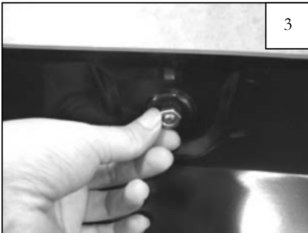
Place a Nut (NU1-0019) over the end of each Bolt and tighten, using a 1/2" wrench for the Nut and the supplied Torx Bit (SW1-0052) for the Bolt. Repeat for remaining pockets.