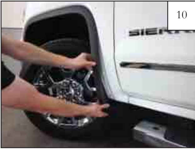
Starting at the lower rear end of the factory flare, firmly grip part and pull to remove from vehicle. Note: You will hear popping sounds as the factory fasteners release from vehicle. This is normal.