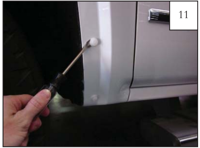
Use a pry tool to remove any remaining factory fasteners that may have stayed on the vehicle during the removal process.