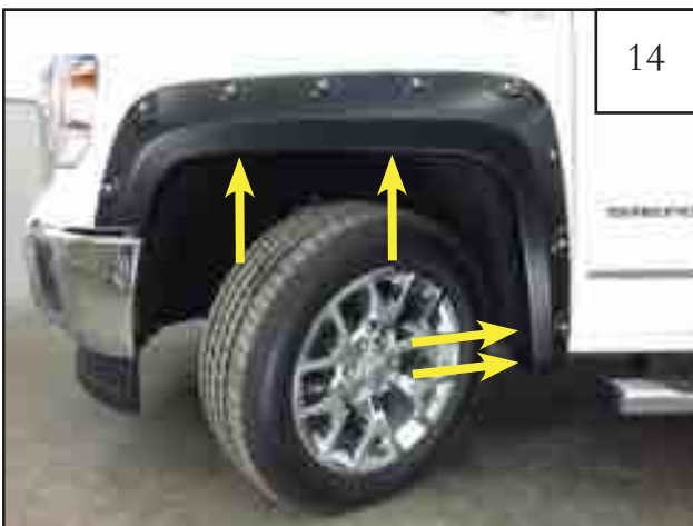
While holding Flare on vehicle, install supplied screw (SW1-0056) into the two upper and lower factory holes locations. Do not fully tighten at this time.