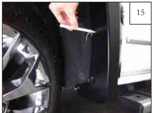
Using a grease pencil or marker, mark one hole location for drilling using the upper rear hole location in the flare as a guide. Note: This step not needed for models with factory installed mudflaps.