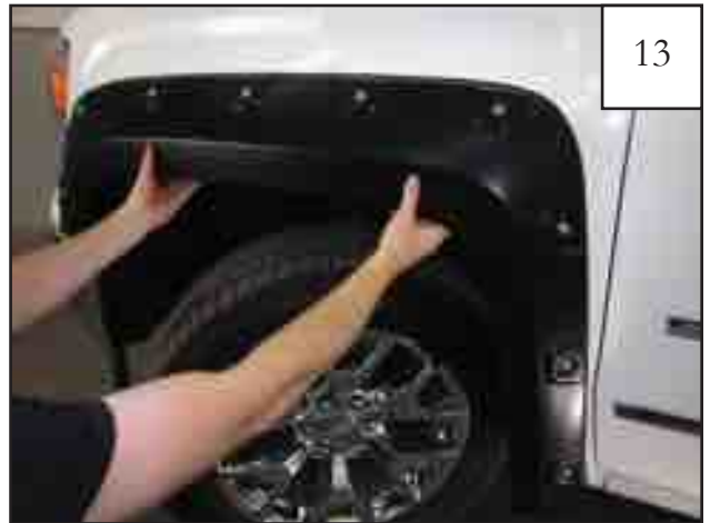
Hold Front Flare up to wheel well to confirm fit. Do not install fasteners at this time.