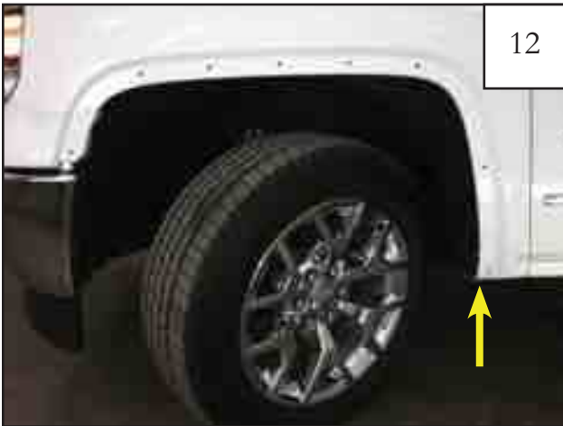
Reinstall factory fastener removed in step 9 using a 1/2" socket and wrench.