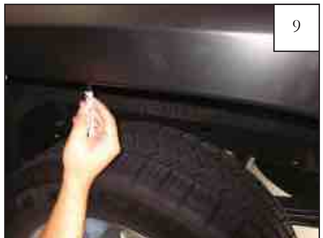
Hold flare firmly in place on fender. Start supplied screw (SW1-0056) at bottom most screw locations (shown). Do not tighten.