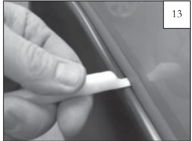
Using supplied Edge Trim Tool, seat edge trim against vehicle by hooking curved end under edge trim at one end of flare. Next, slide around outer edge of flare to the other end.