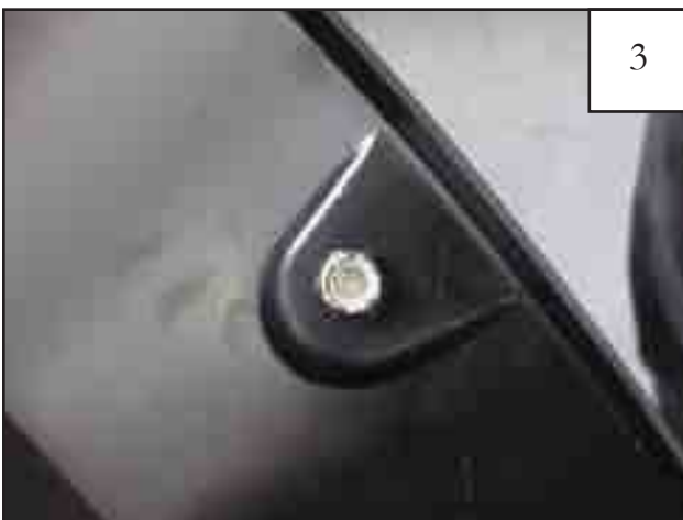
Place a Nut (NU1-0019) over the end of each Bolt and tighten, using a 1/2" wrench for the Nut and the supplied Torx Bit (SW1-0052) for the Bolt. Repeat for remaining pockets.