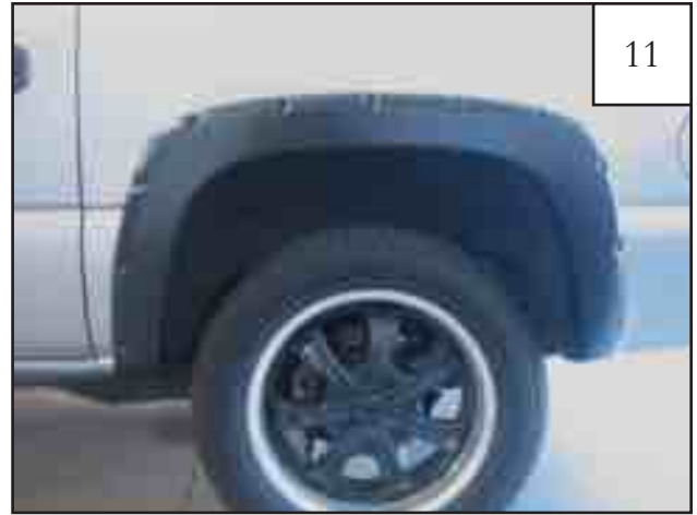
Tighten the topmost two Screws first, then the forward two, and then the rearward two.