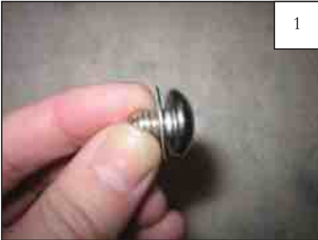
Put a Washer (WA1-0010) on each Bolt (SW1-0059).