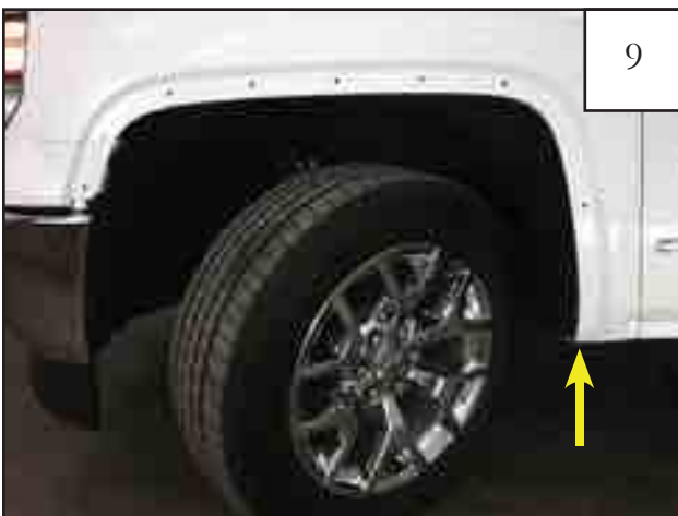
Reinstall factory fastener removed in step 6 using a 1/2" socket and wrench.