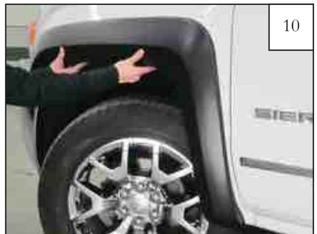
Hold Front Flare up to wheel well to confirm fit. Do not install fasteners at this time.