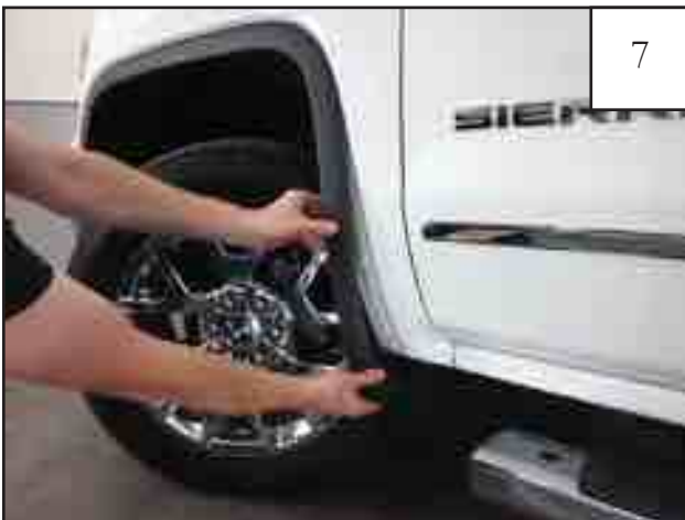
Starting at the lower rear end of the factory flare, firmly grip part and pull to remove from vehicle. Note: You will hear popping sounds as the factory fasteners release from vehicle. This is normal.