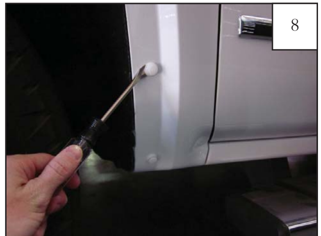
Use a pry tool to remove any remaining factory fasteners that may have stayed on the vehicle during the removal process.